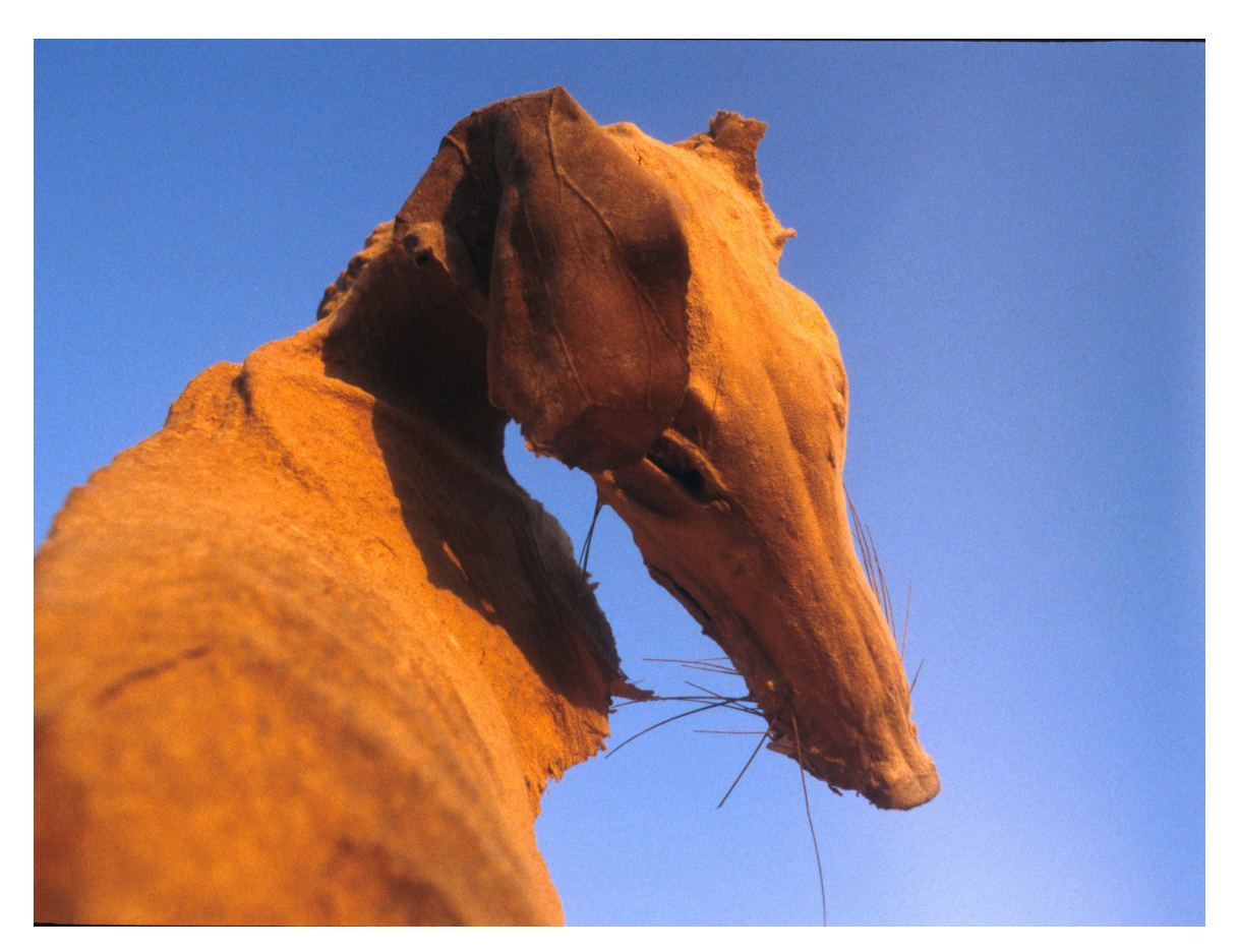
Figure 2, Nearly 2000-year-old Arabian Red Fox

Remarkably well-preserved bones, scat and artifacts were found in both limestone and lava caves in many areas of Saudi Arabia. An example of such a limestone cave is Murubbeh or Shawiah Cave (designated B7 Cave by Benischke and others) in whose deepest recesses a temperature of 16.7° C was measured, unusually cool for a cave on the Summan Plateau. Two human skulls, many bones, countless hyena coprolites, an animal-skin "blanket" and the naturally mummified body of an Arabian Red Fox, Vulpes vulpes arabica (Fig. 2), were discovered in this cave located 200 kilometers northeast of Riyadh. The well preserved fox was brought all the way to the Natural History Museum in London for identification and was carbon dated at 1890 years by ETH, the same Swiss lab that dated the Iceman.