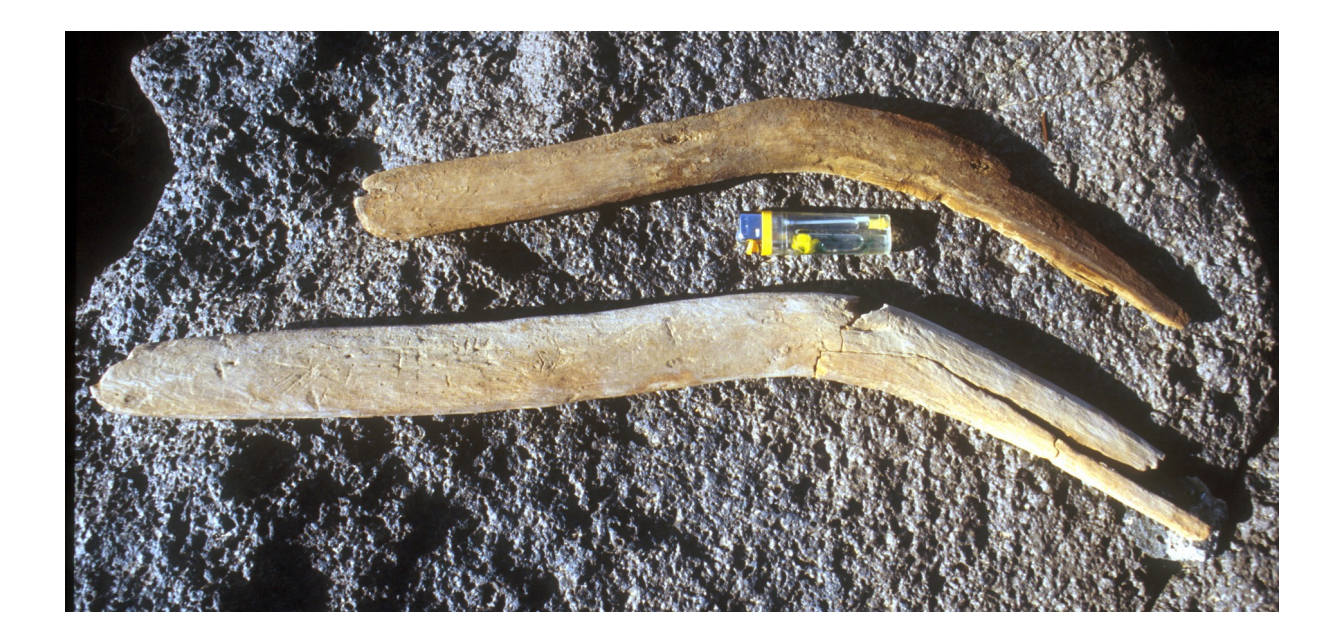
Figure 4, Throwing Sticks discovered in Ghostly Cave

The oldest bones found in a Saudi Cave and dated, were discovered at the distal end of the Wolf Den Passage of Umm Jirsan Cave. Two fragments of human skulls (Fig. 5), carbon-dated at 4040±30 and 3410±30 years BP were found lying on the surface of a sediment floor measured 1.2 meters deep in another part of the cave. It is speculated that digging may result in the discovery of even older bones in this cave. Numerous basalt geofacts (Fig. 6) of a size and shape useful for cutting, scraping and puncturing, were found gathered together in the Workshop Passage of Umm Jirsan Cave. These may have been used as tools (Pint, 2009).