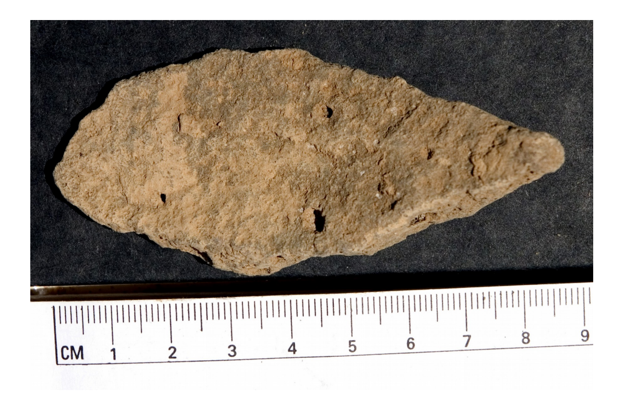
Figure 6, One of many pointed or sharp-edged basalt fragments in Umm Jirsan Cave

Umm Jirsan Cave is located inside Harrat Khaybar, a lava field covering some 12,000 square kilometers with lava flows ranging in age from five million years to historic. Roobol and Camp (1991) report ancient structures within the borders of Harrat Khaybar and Kennedy (2012) estimates there are remains of 500 kites in this lava field, presumably used to trap animals.