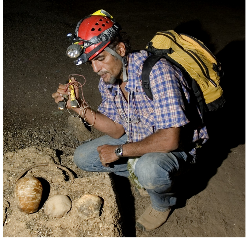
Figure 5, Fragments of three human skulls found in Umm Jirsan Cave

The oldest bones found in a Saudi Cave and dated, were discovered at the distal end of the Wolf Den Passage of Umm Jirsan Cave. Two fragments of human skulls (Fig. 5), carbon-dated at 4040±30 and 3410±30 years BP were found lying on the surface of a sediment floor measured 1.2 meters deep in another part of the cave. It is speculated that digging may result in the discovery of even older bones in this cave. Numerous basalt geofacts (Fig. 6) of a size and shape useful for cutting, scraping and puncturing, were found gathered together in the Workshop Passage of Umm Jirsan Cave. These may have been used as tools (Pint, 2009).