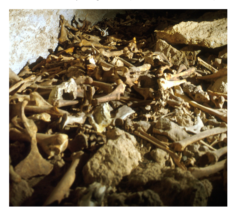
Figure 3, Cache of mixed bones in Black Scorpion Cave

presumably carried into the cave by hyenas, wolves and foxes, as suggested by great quantities of their scat, also very well preserved (Al-Shanti and others, 2002).